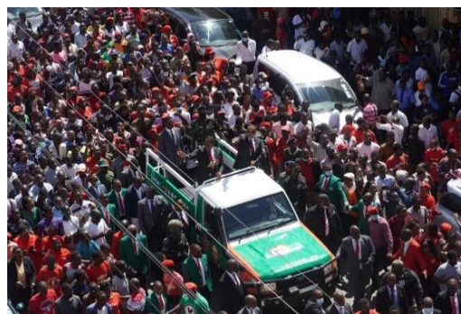
6 May 2020, Blantyre City, Malawi. Opposition party leaders Dr Lazarus Chakwera and Dr Saulos Chilima on their way to present their nomination papers for candidacy for the upcoming elections in July.

In Malawi , Malawi Health Equity Network (MHEN) highlights the difficulties that the political environment in the country has posed. 8 With the presidential elections results of May 2019 annulled by the Supreme Court on electoral irregularities grounds and new elections slated for early July 2020, lockdown measures have been resisted by civil society and citizens, and are seen as a political move that could potentially allow the ruling government to remain in power.